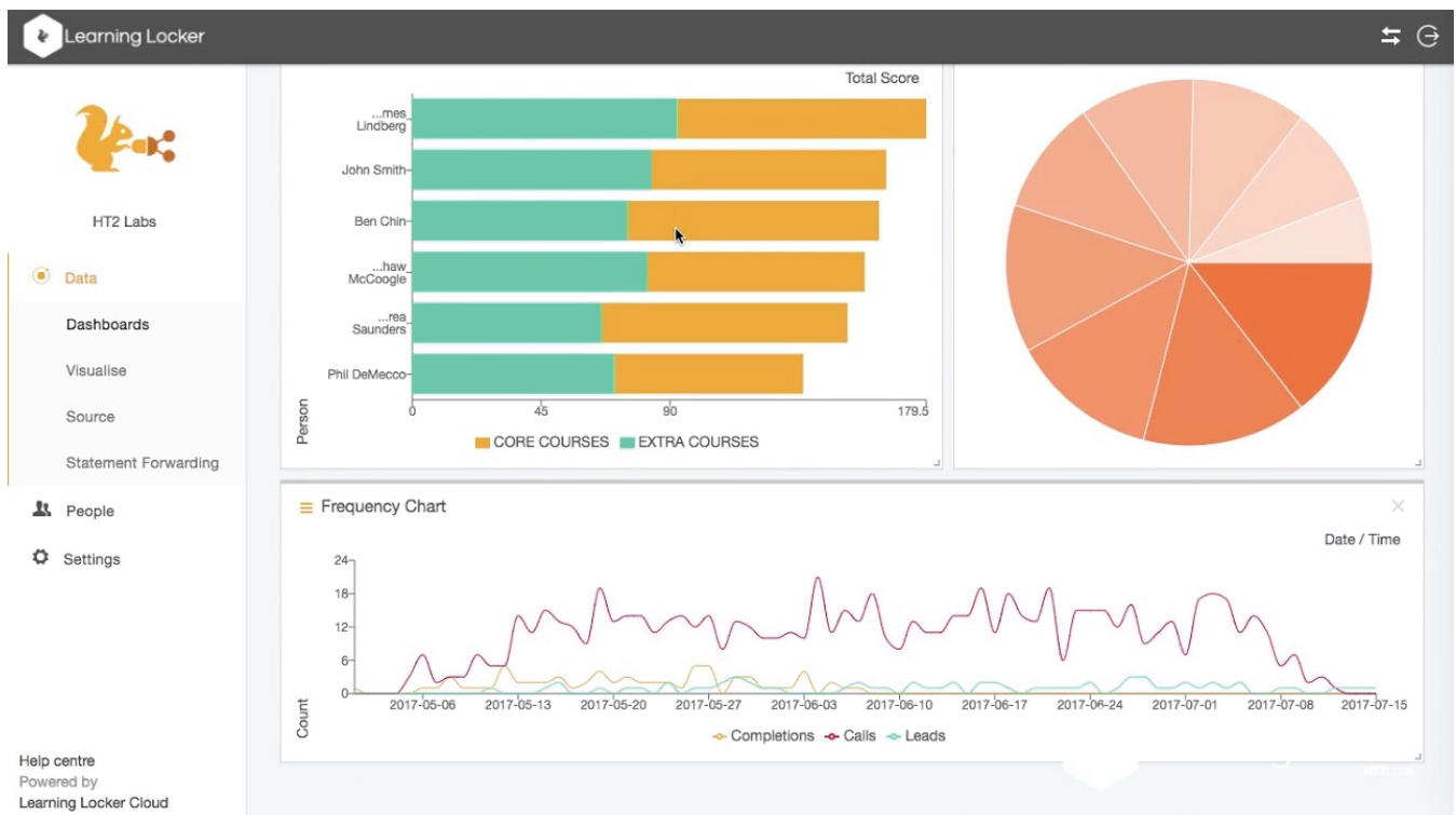
Illustration 2: Learning Locker Dashboard